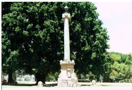
Memorial to Jewish Services Personnel, Kings Park ( http://www.warmemorials.net/memorials/perth/kingspark )