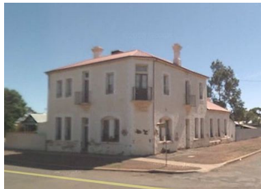
Tower Hotel, Heidelberg Rd, Alphington (http://www.panoramio.com/photo/46753405) Duke of York Hotel, cnr Burt & Thomson Sts, Boulder demolished in 2011 (Google 2011)