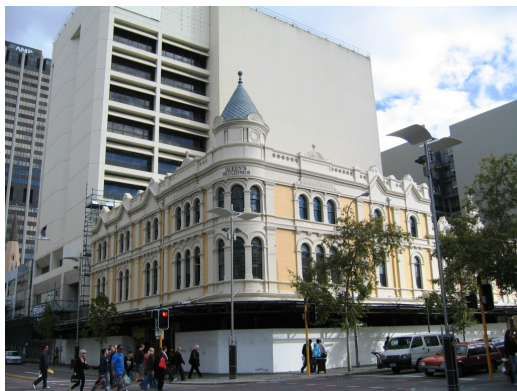
3 rd floor etc, Queen's Buildings, cnr William & Murray Sts Perth