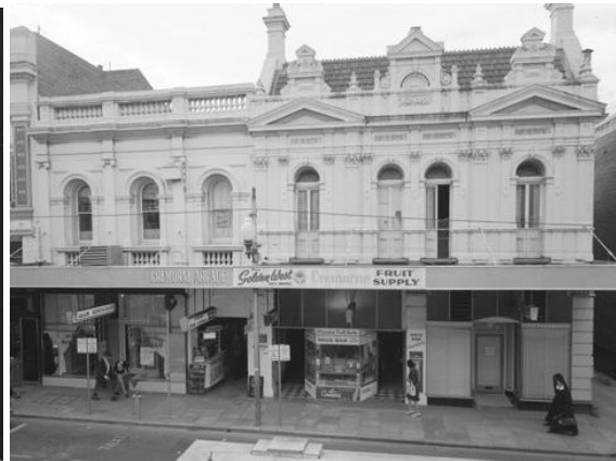
Cremorne Chambers, 572-578 Hay St Perth