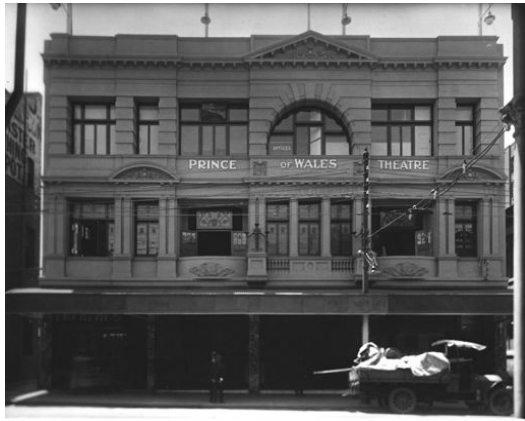
Prince of Wales Theatre, Murray St Perth (SLWA 001675D)