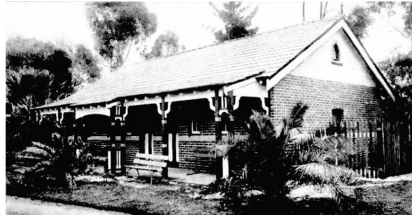
Bath House, South Perth Zoological Gardens ( The Western Mail , 9 August 1918, p.2)