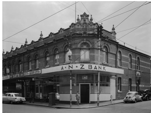
Monash House, cnr Hay & King Sts Perth (SLWA 237849D)